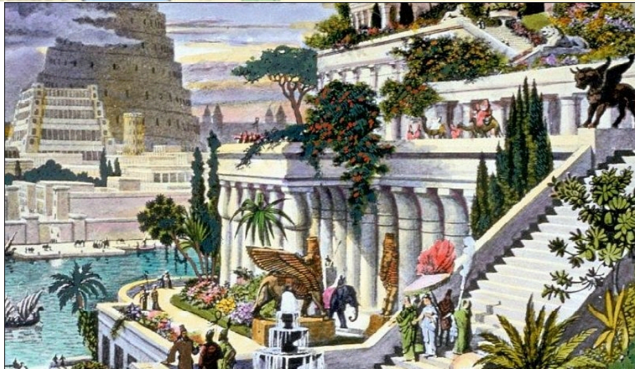
Hanging Gardens of Babylon